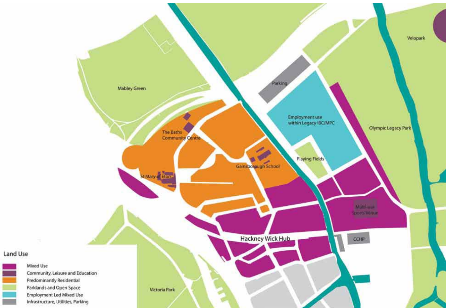
Figure 15: Land Use