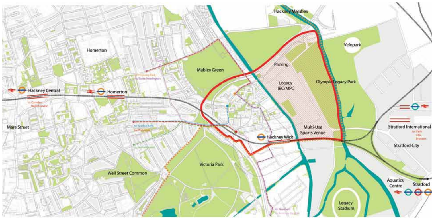
Hackney Wick Study Area and Strategic Accessibility